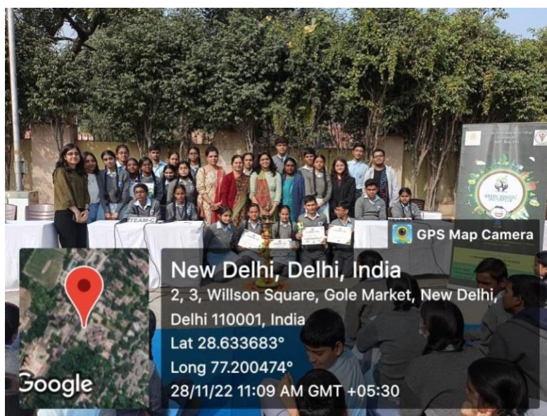
Team GSI, Sri Venkateswara College with all the participants and Principal of Navyug School