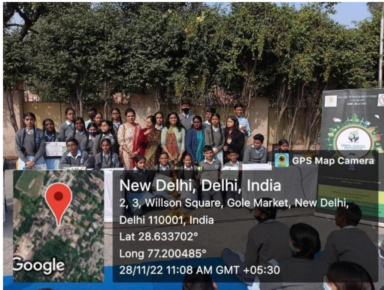
Team GSI, Sri Venkateswara College with participants of Navyug School