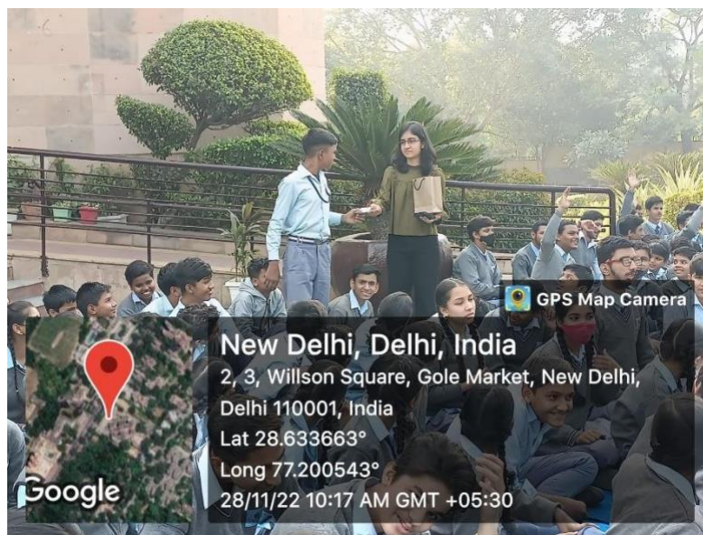
Goodies being distributed to Enthusiasts by Team GSI, Sri Venkateswara College.